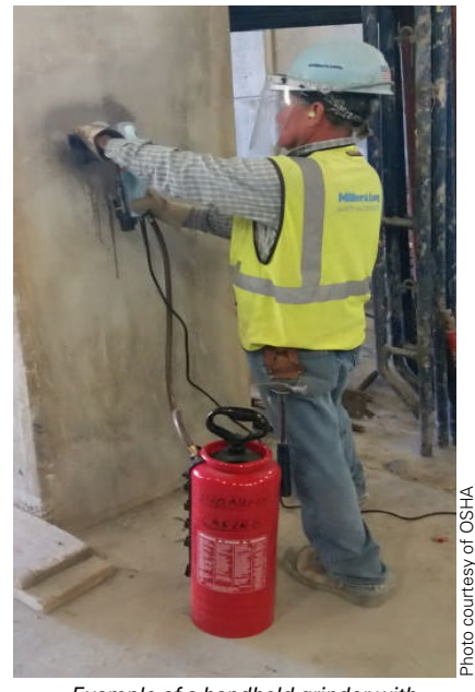
Example of a handheld grinder with integrated water delivery system.

Electrical Safety. Where water is used to control dust, electrical safety is a particular concern. Use ground-fault circuit interrupters (GFCIs) and watertight, sealable electrical connectors for electric tools and equipment on construction sites.