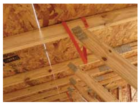
A pre-installed attic anchorage system.

Consider leaving anchors in place : Where practical, employers should consider leaving anchors in place. This can make the current job simpler and reduce the burden for attic workers in the future.